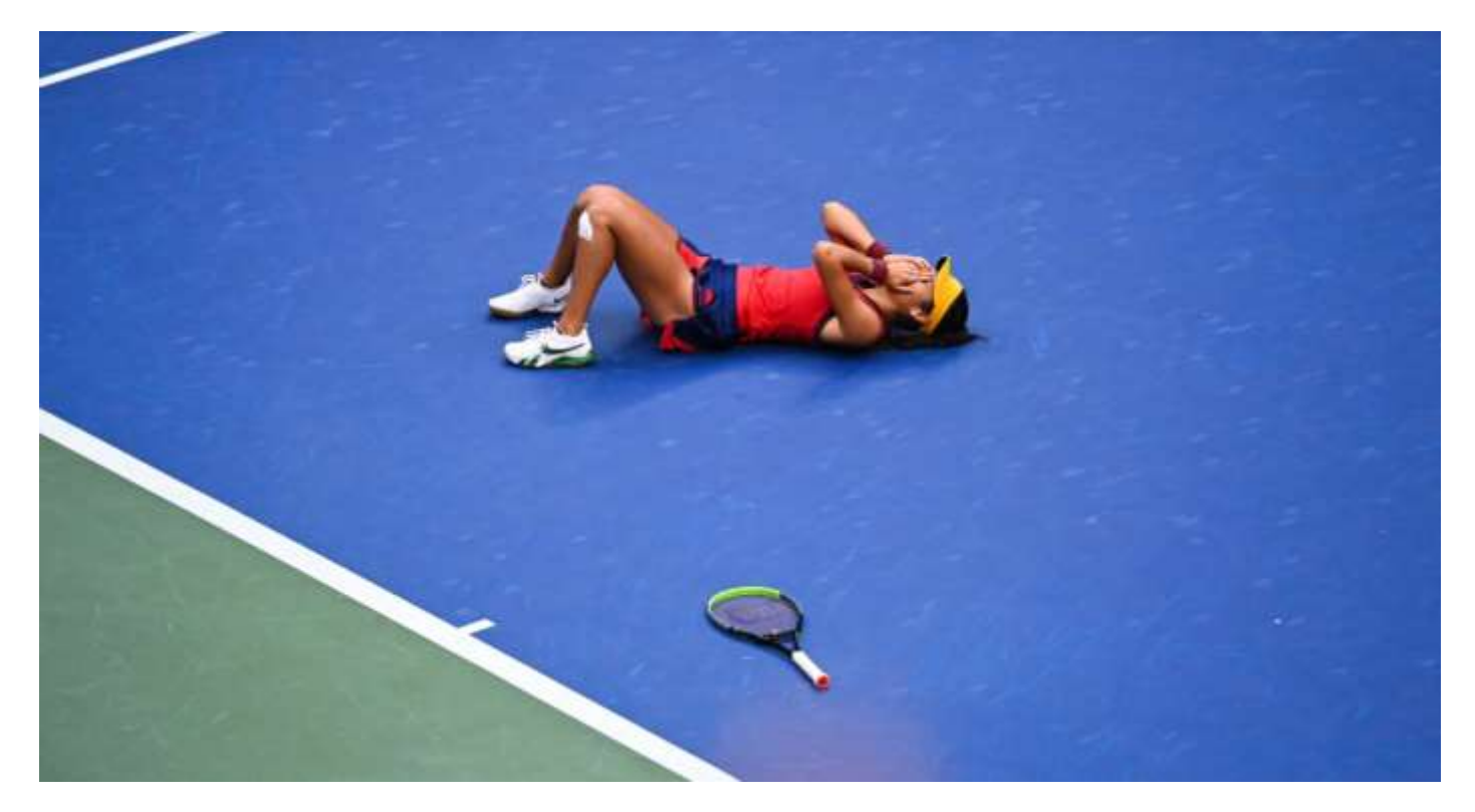
Give information about the girl. Link elements to make correct sentences.